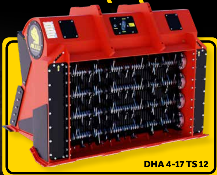
DHA 4-17 TS 12