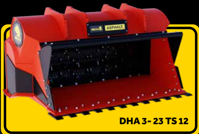
DHA 3-23 TS 12