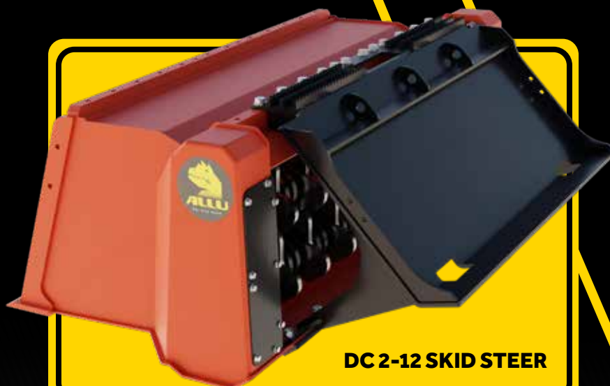
DC 2-12 SKID STEER

With the special adapter, the DC 2-12 will transform your lightweight fleet to multifunction tools in material processing.